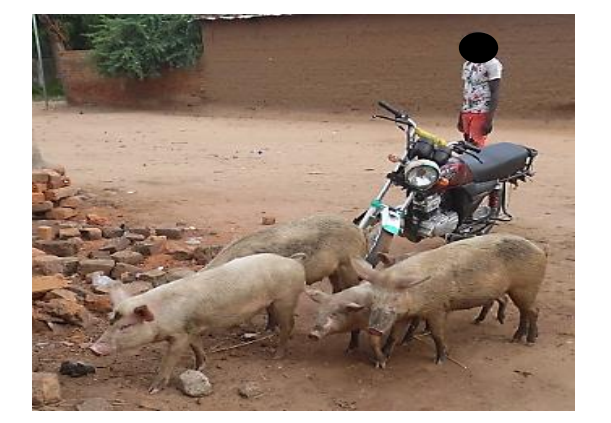
Figure 4 : Transport pigs for farmed on foot