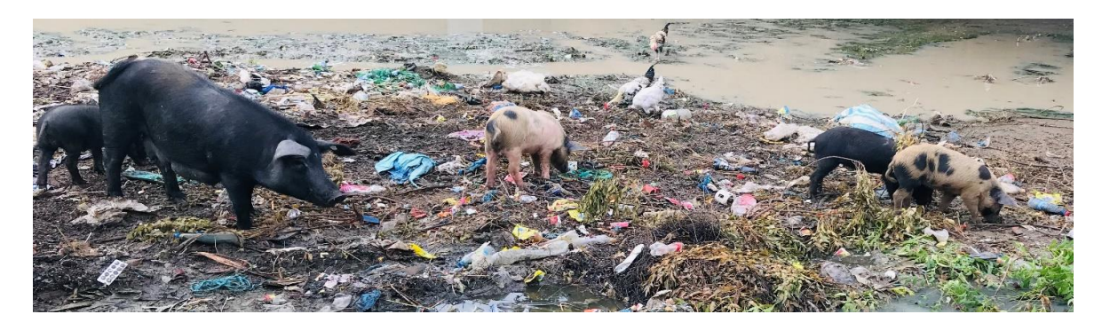
Figure 6 : Pigs wandering in search of food and water