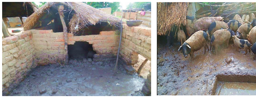
Figure 2 : Housing partially broken